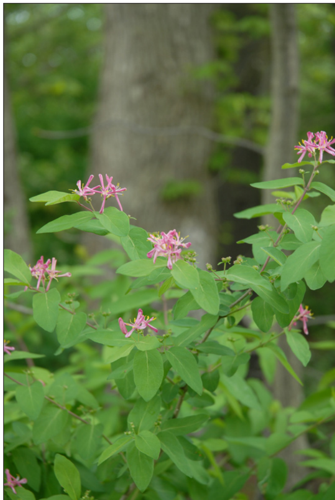
Tartarian honeysuckle.