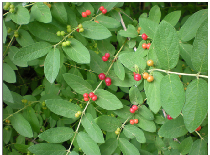
Honeysuckle fruit.