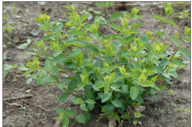
Honeysuckle sprouts as a result of cutting off the shrub at the ground. A follow-up foliar herbicide application can now be applied.

or overspray. In addition, care needs to be taken to ensure that herbicides are sprayed to wet the foliage but not to the point of runoff.