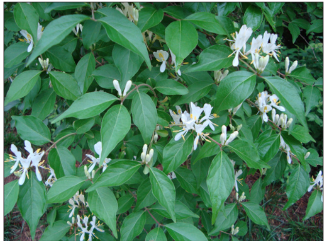
Amur honeysuckle.