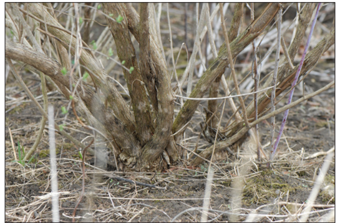
A basal application of herbicide needs to be made to the lower 12–18 inches of the honeysuckles’ stems.

Herbicides (both water- and oil-soluble) recommended for cut stump treatments of bush honeysuckle are listed in Table 2. Late summer, early fall, or dormant season applications have all proven to be effective. Avoid applications during sap-flow (spring) as this lessens the effectiveness of the herbicide application.