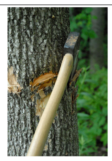
Figure 5. Hatchet used for spaced cuts (hack) with herbicide applied in cut (squirt).