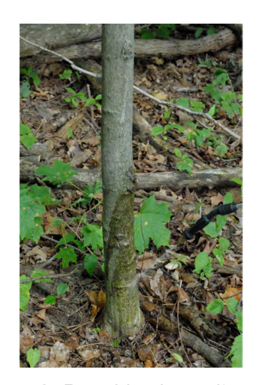
Figure 3. Basal bark application.