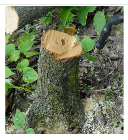
Figure 4. Cut stump application.

<sup>1</sup>These comments are not intended to be a substitute for the herbicide labels. To ensure the safe and effective use of the herbicides recommended in this publication read the label and SDS (Safety Data Sheet).