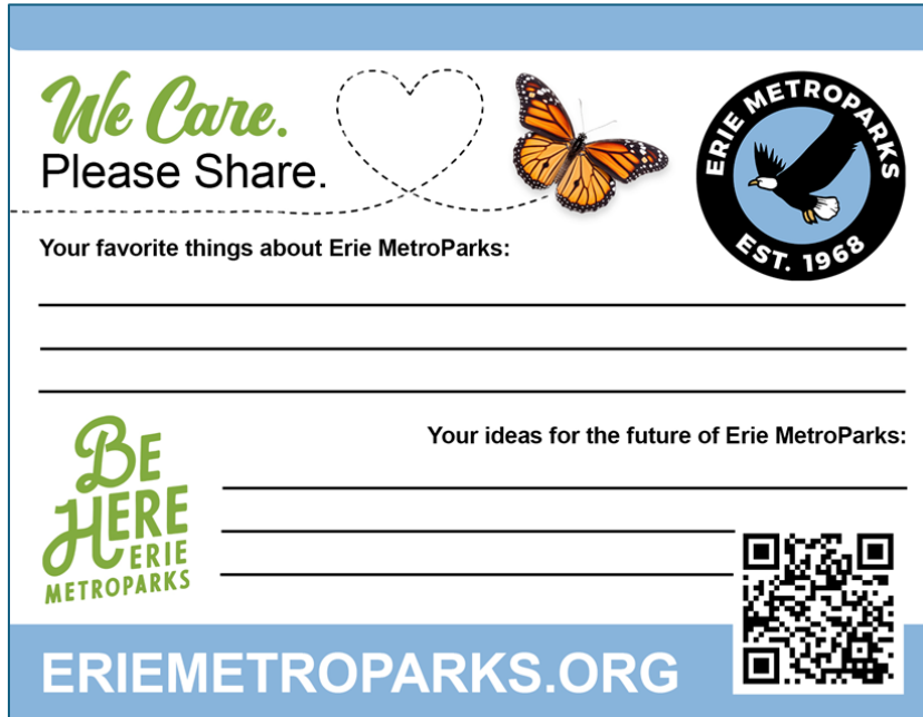
(top: sample of a comment card, bottom: sample of community flyers)