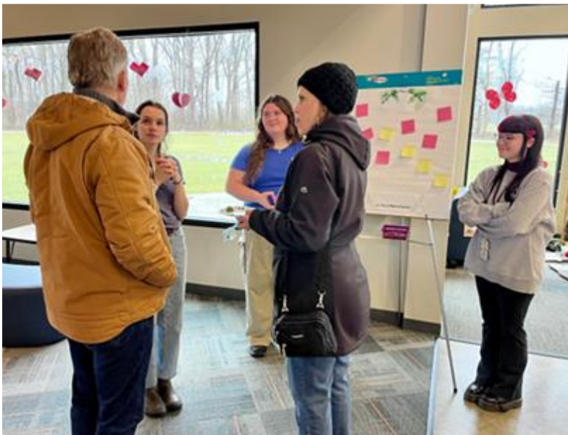
(Bottom left, Community engagement open house; bottom right, presentation to community partners)