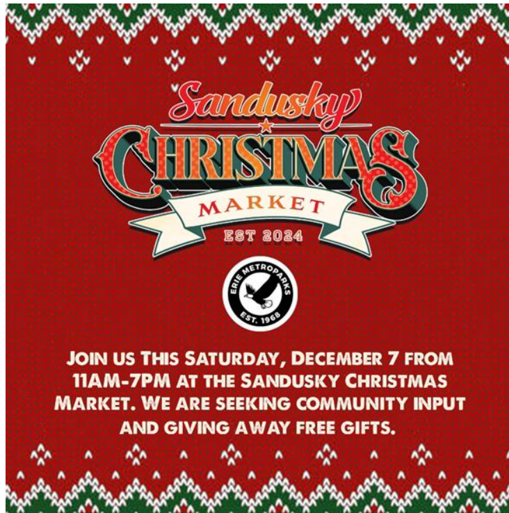
(Above, Sample of social media post; urban outreach)